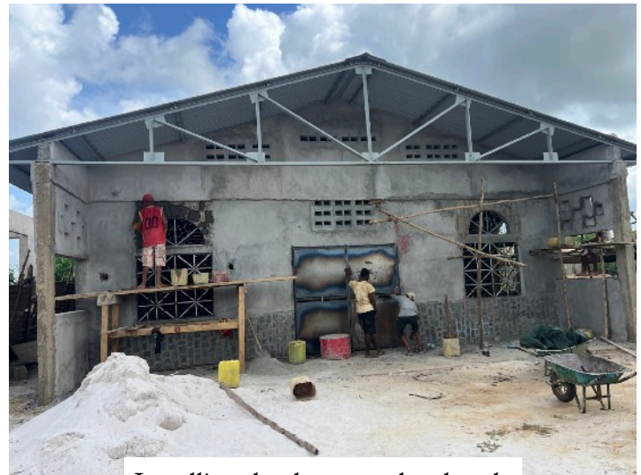
Installing the doors on the church