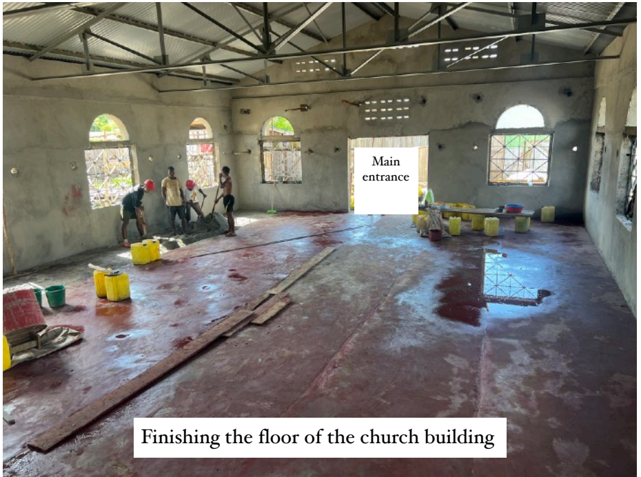
Finishing the floor of the church building