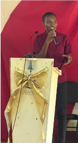
One of the young preachers