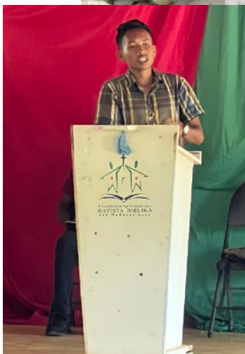
Another young preacher