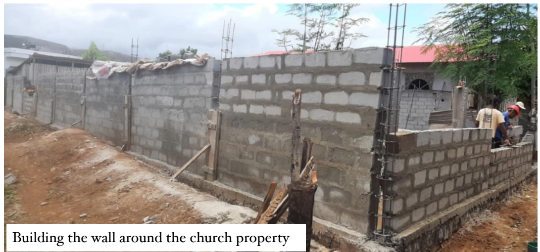
Building the wall around the church property